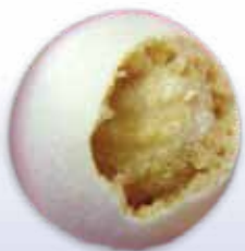
Dough-coated peanut cut away to show coating detail.