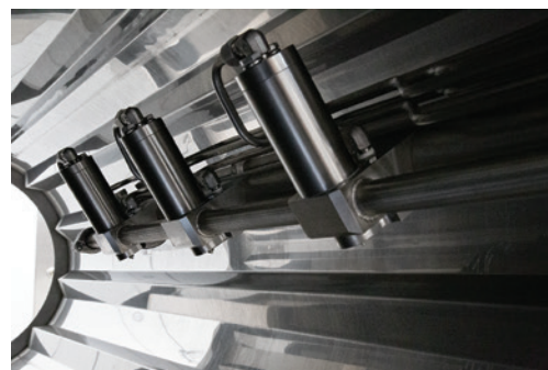
Slurry and continuous oil spray applicators available.