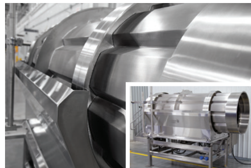
Optional ultra-sanitary single wall drum.