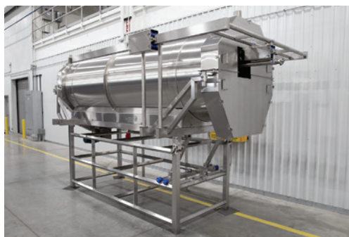
Optional dust collection/containment shrouds.

Equipment is designed for ease of sanitation to minimize downtime and to maximize productivity.